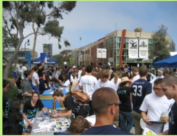
Crowds of new students enjoying the Student Services Fair located near RIMAC on Ridgewalk!