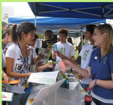
One Stop greeting students at the Student Services Fair