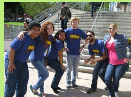
FOOSH actors ready to participate in FFOG

The best leadership style? Of course it's whatever you prefer, but most will tell you to mix and match. Different situations call for different plans of action. Just use your best judgment and you'll be sure to achieve great things.