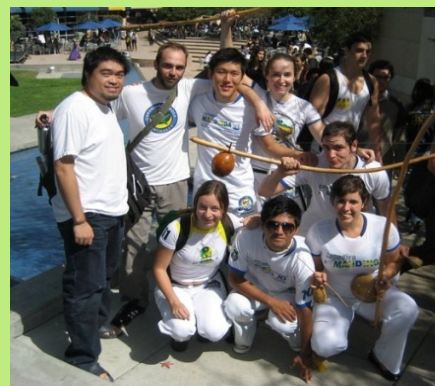
Students excited for Fall Festival on the Green

Other publicity events include the Campus Resource Fair on September 19 th where academic majors, recreation clubs, and other campus departments will be represented, and Panhellenic and InterFraternity Council Information nights on September 22 and October 2 respectively. See you there!